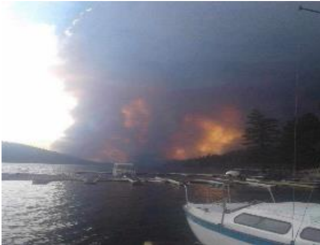
Creek Fire – Sat. Sept. 5 – about 12 noon picture taken from Lake Shore marina looking west.

2020...One reference to 2020 relates to vision. If you have 20/20 vision you can see clearly at a distance of 20 feet. However, I confess I don't see anything clearly which is related to the year 2020. Almost everything from January to October 2020 is a blur. However, (in October, 2020) I have found a few things which are very clear. Since our last newsletter our mountain community in north eastern Fresno and Madera counties has been ravaged with fire and enveloped in daily smoke. Some days it is thick and lingers all day.