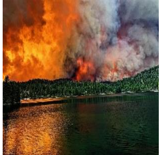
Creek Fire – Sat., Sept. 5 – about 10 am west end of Huntington Lake at dams.