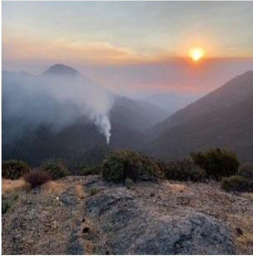
Creek Fire at Camp Sierra – Fri., Sept. 4 - about 4 pm. Picture taken from Helicopter pad at Big Creek.