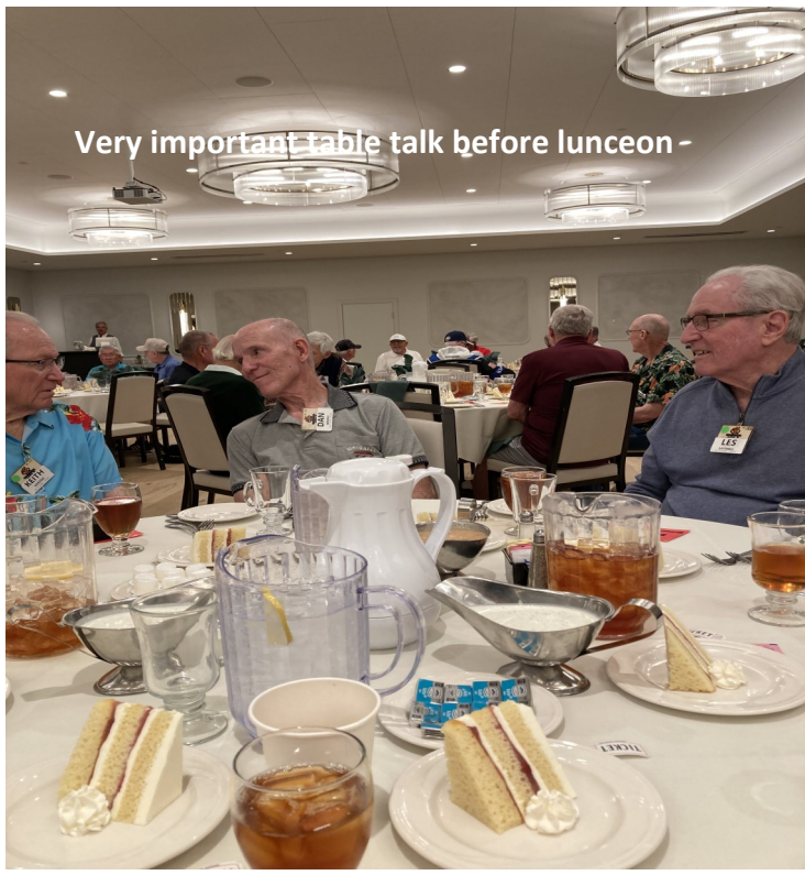
Very important table talk before luncheon -