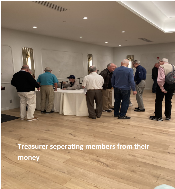
Treasurer separating members from their money