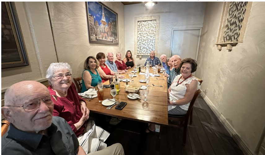
AUGUST DATE NIGHT PHOTO— OVIDIO'S

Starting at the bottom left, around the table.