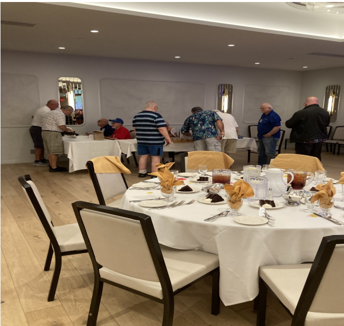
Checking In and finding the right seat