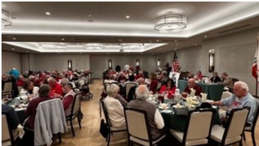
Members and Guest enjoy luncheon